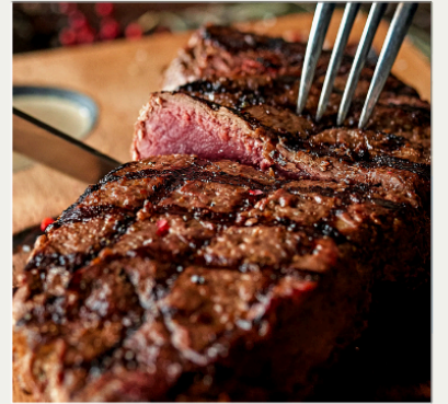
Ribeye Steaks Needed!!

The American Beefalo Association has been working with Clemson University to conduct a meat study that will update our current claims regarding the health value of our product. Through this study, we hope to gather Beefalo ribeye samples directly from our members across the country, so we can have a fair and accurate representation of our breed. Because there are so many varieties that can affect the measure that are to be tested, we would like the sample pool to be as consistent as possible, therefore, through recommendations from the University, we have compiled a list of criteria for the testing and sample submission.